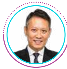
Richard Teng Regional Head of MENA Binance Panel Discussion : Recent developments in virtual asset regulations and operations in the GCC